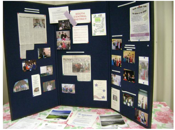
One of the table displays. This display is from South Central along with information for all to pick up and take.

All Smokey Bear and Woodsy Owl came from the Delphinium Garden Club - NW District