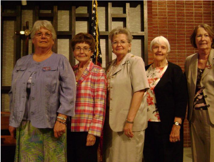
PAST AND PRESENT OKLAHOMA GARDEN CLUBS, INC. PRESIDENTS.