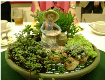
One of the table Decorations that became the door prizes.